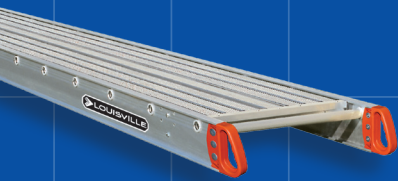
GUARDRAIL STAGES FLYER v2