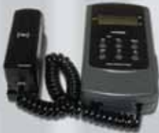
Gloss Checker (IG-331)