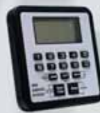
Digital Timer (ADTIMER)