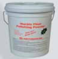
Polishing Powder (ADM5x10) (ADM5x50)