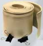
Splash Guard (AD17SPG)