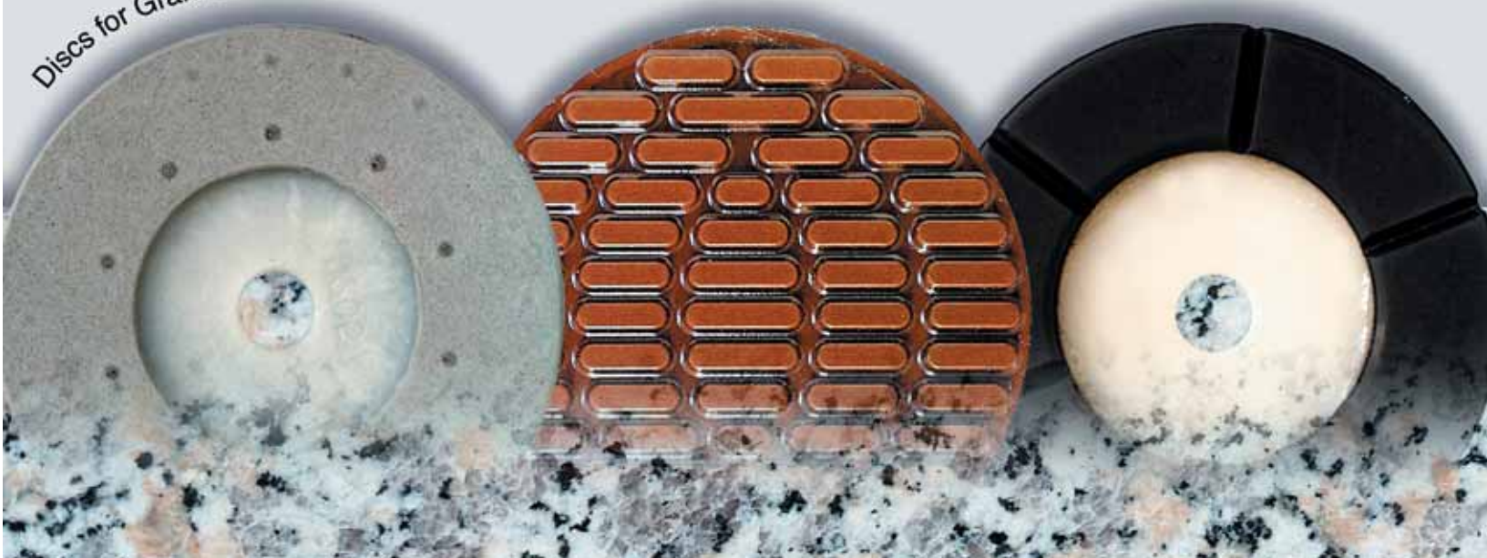
Discs for Granite