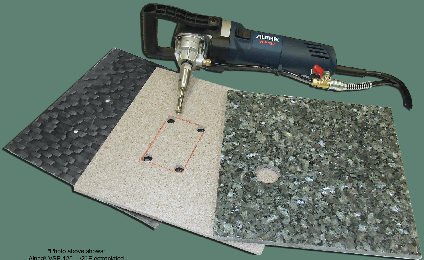
*Photo above shows: Alpha® VSP-120, 1/2" Electroplated Drill Bit and the Alpha® Drill Bit Adapter.