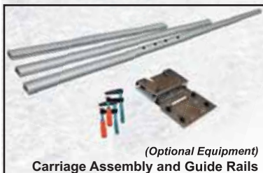
(Optional Equipment) Carriage Assembly and Guide Rails