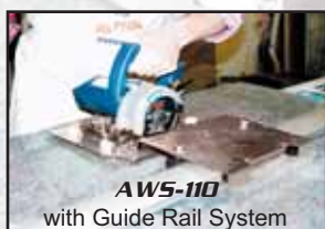
AWS-110 with Guide Rail System

The AWS-110 may be used several ways: with the reversible ruler guide down, one can work off the edge of the stone; in the up position, it can glide along a straight edge. Of course, it may be used free hand and either wet or dry. Additionally, utilizing the optional Carriage Assembly, one can use the Alpha ® Guide Rails to perform machine precision cuts. The AWS-110 is more than a saw; it is a complete cutting system that can be used for cutting, scoring, profiling and more. It is designed and manufactured with the highest quality standards, as are all Alpha Professional Tools ® products.